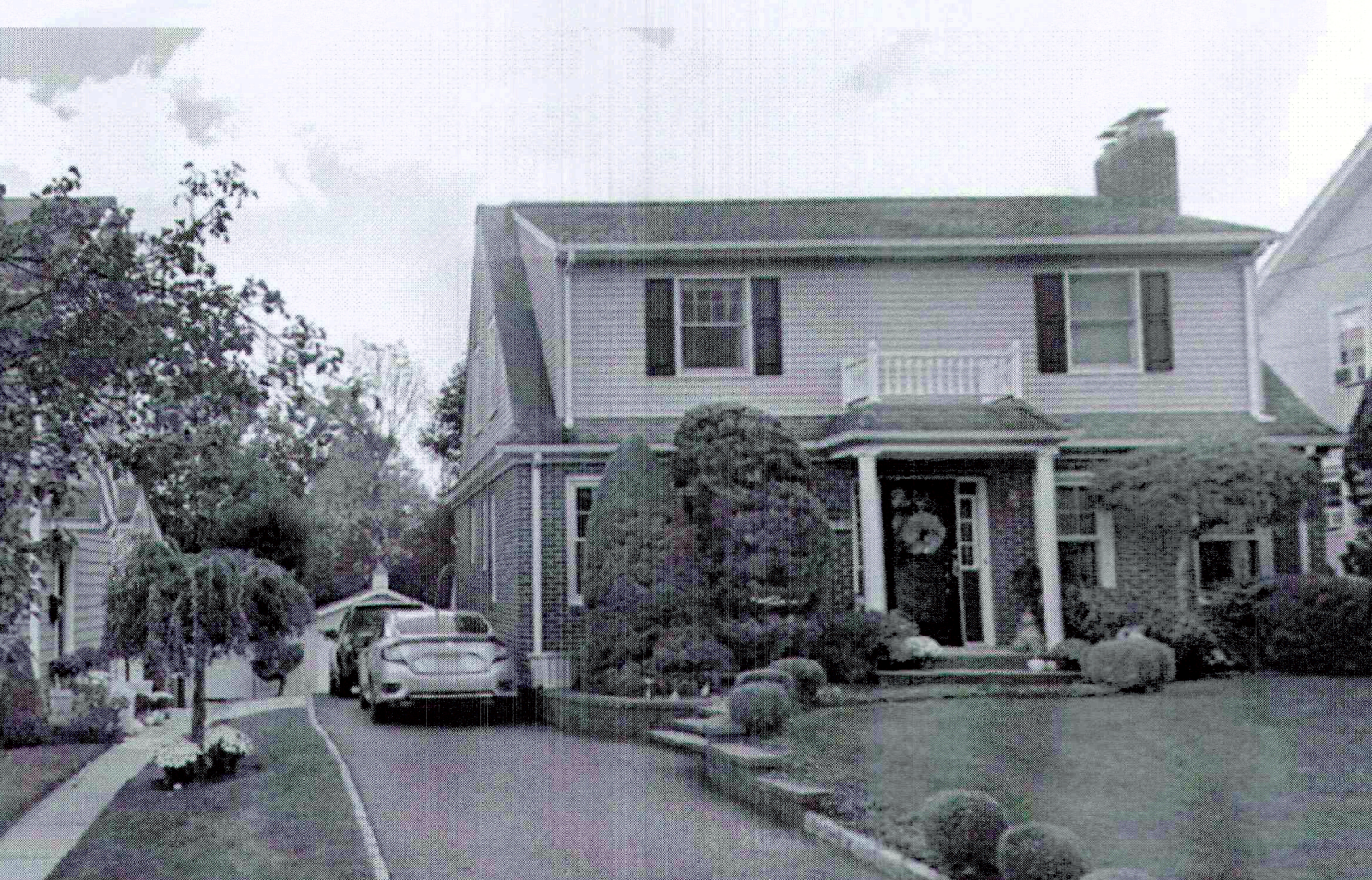
49 MONTROSE AVE