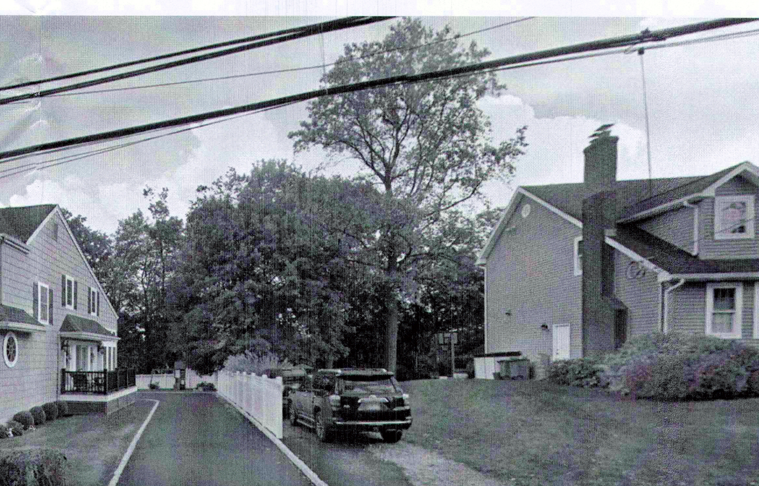
45 MONTROSE AVE - SIDE YARD