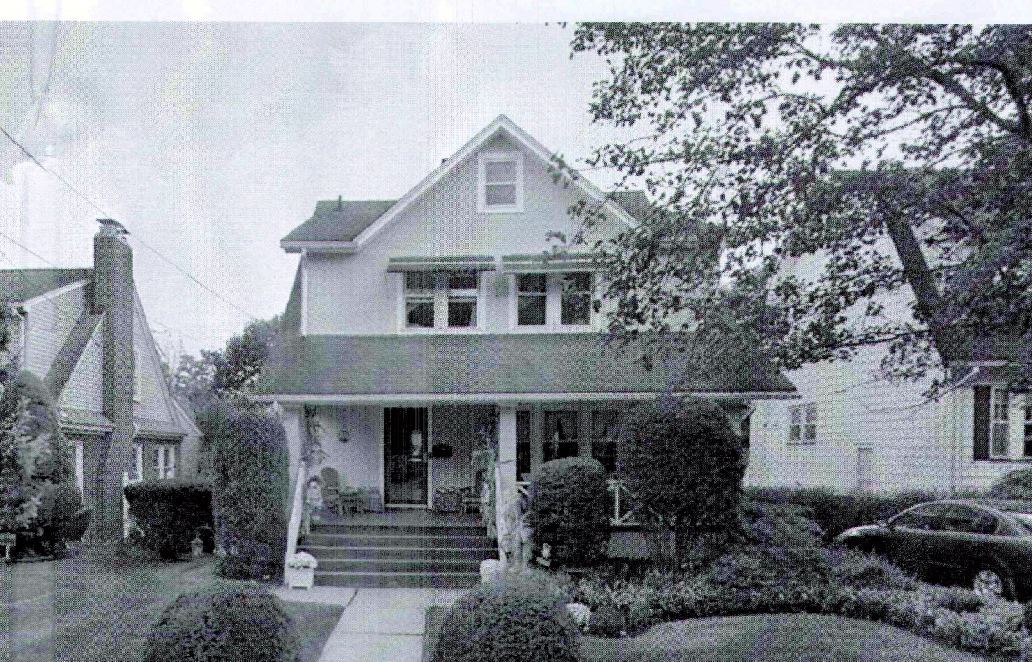
51 MONTROSE AVE