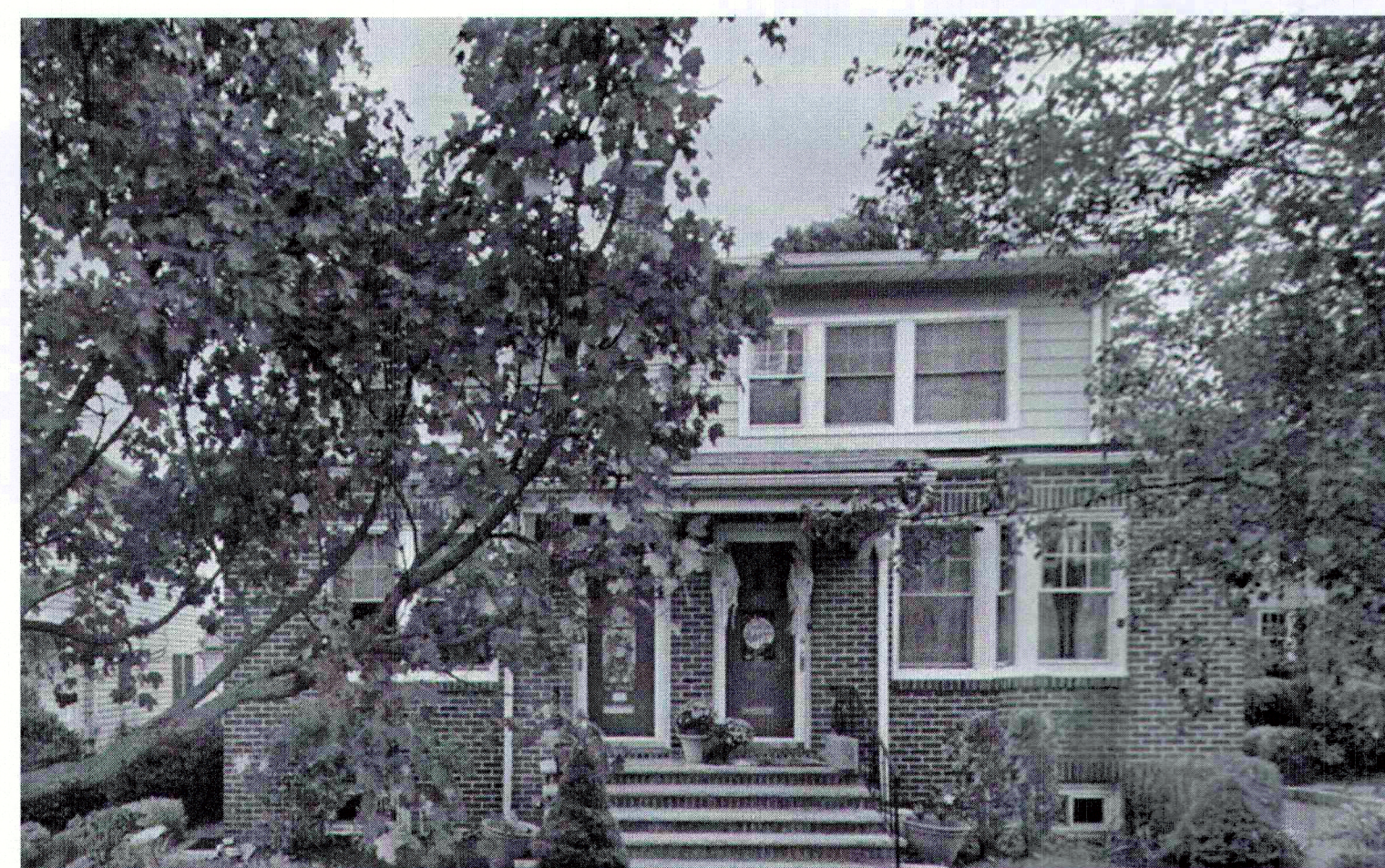
39 & 41 MONTROSE AVE

** EXISTING NON CONFORMING * VARIANCE REQUIRED