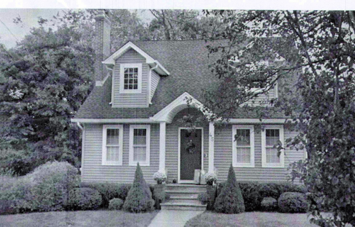
45 MONTROSE AVE SUBJECT PROPERTY