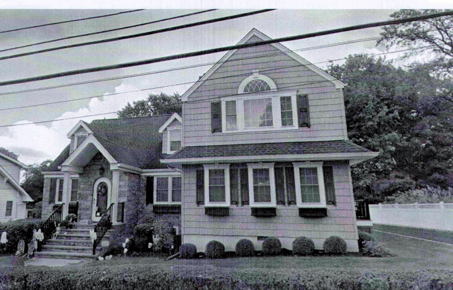
43 MONTROSE AVE